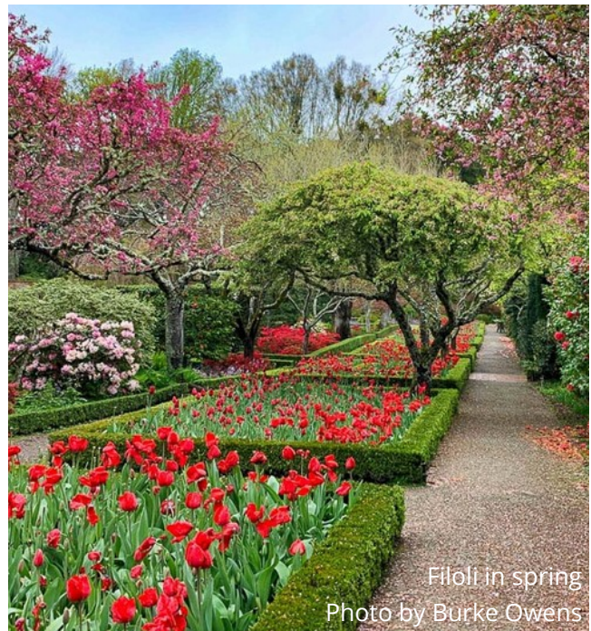
Filoli in spring