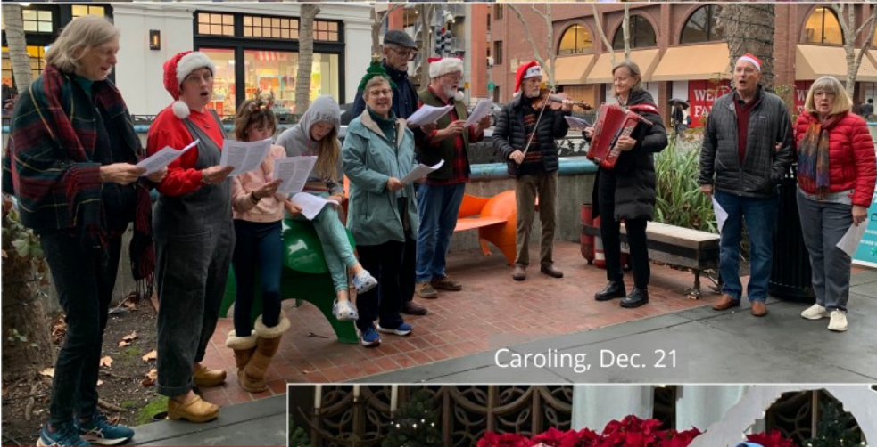
Caroling, Dec. 21