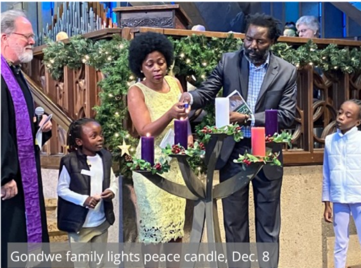
Gondwe family lights peace candle, Dec. 8