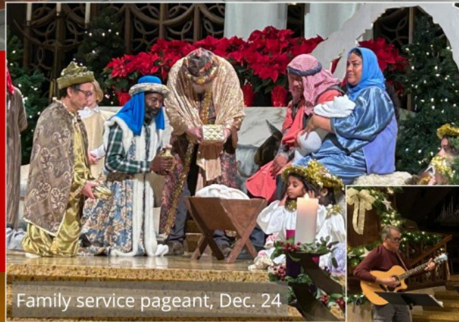
Family service pageant, Dec. 24