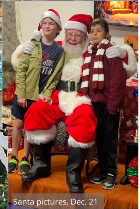
Santa pictures, Dec. 21