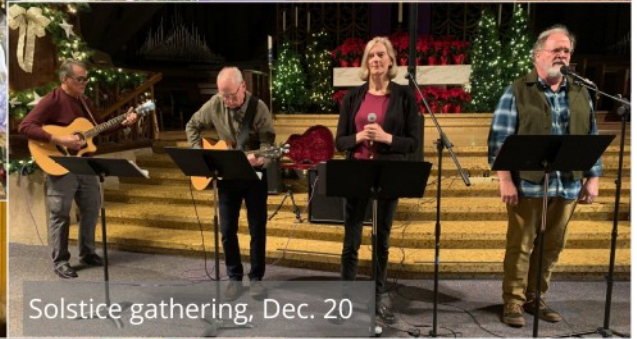
Solstice gathering, Dec. 20