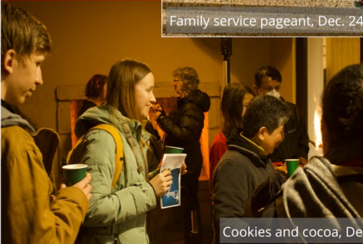
Cookies and cocoa, Dec. 24