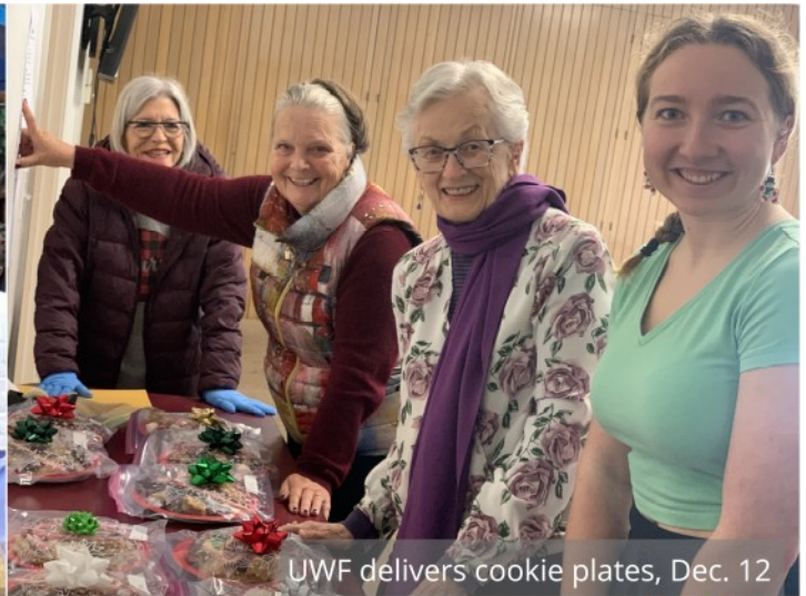
UWF delivers cookie plates, Dec. 12