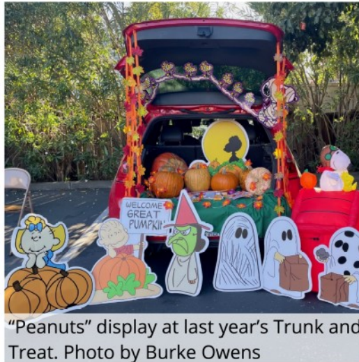
"Peanuts" display at last year's Trunk and Treat.

The Oct. 5 game is also Cardinal Kids Day, so the Kid Zone will be open with athletic activities and Stanford swag giveaways. This is Stanford's first home conference game in the Atlantic Coast Conference (ACC).❖