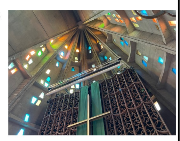
Things are looking up ...