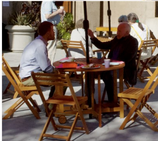
Gathering on the patio for breakfast Easter morning.