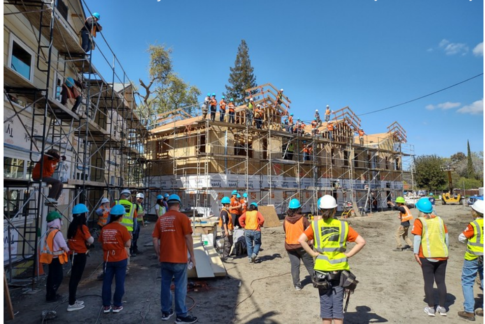
Habitat for Humanity site in Walnut Creek

I am grateful for the opportunity, with God's undergirding, to have participated in the restoration and appreciation of the Greer Road parsonage. May it be the source of great future enjoyment for those who will live, work, and take part in years of activities indoor and outdoor. ❖