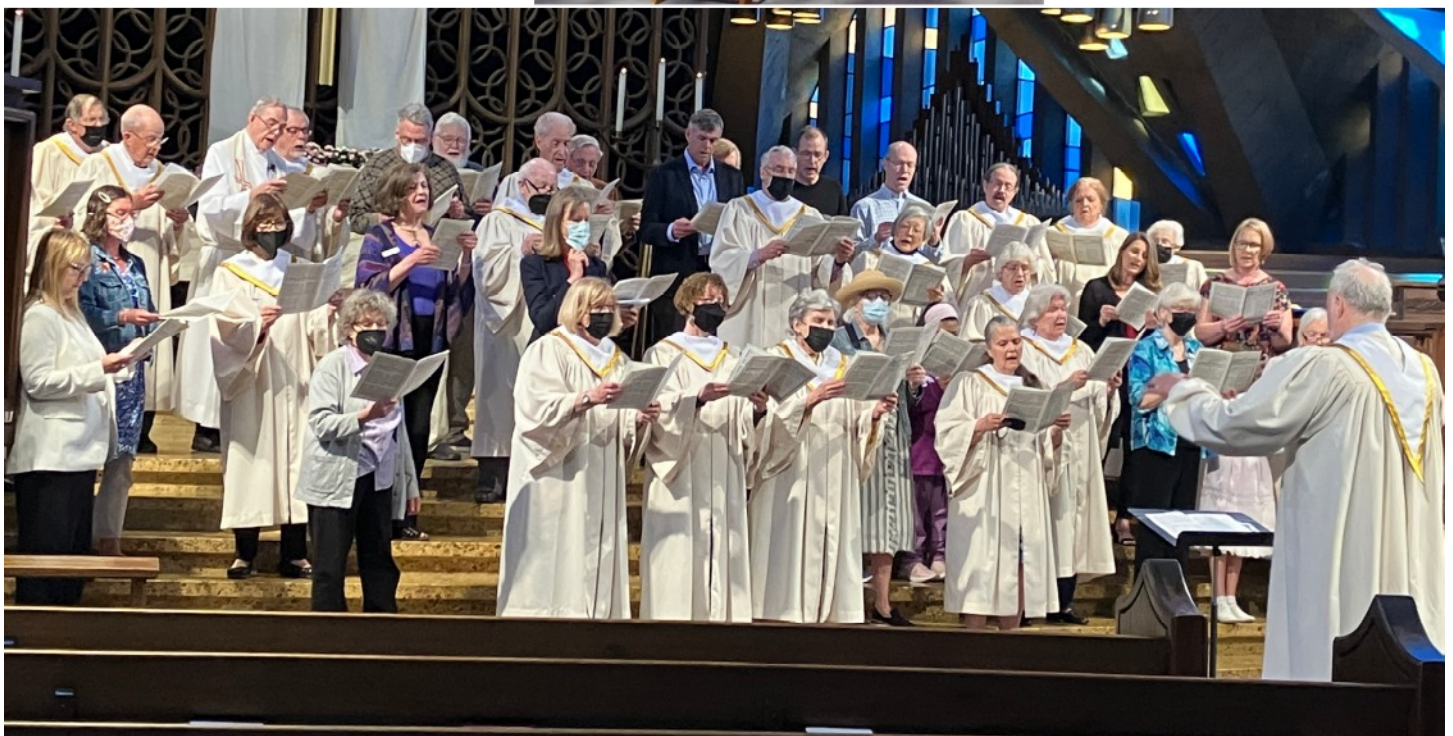
Singing the Hallelujah Chorus after the Easter worship service, April 9.