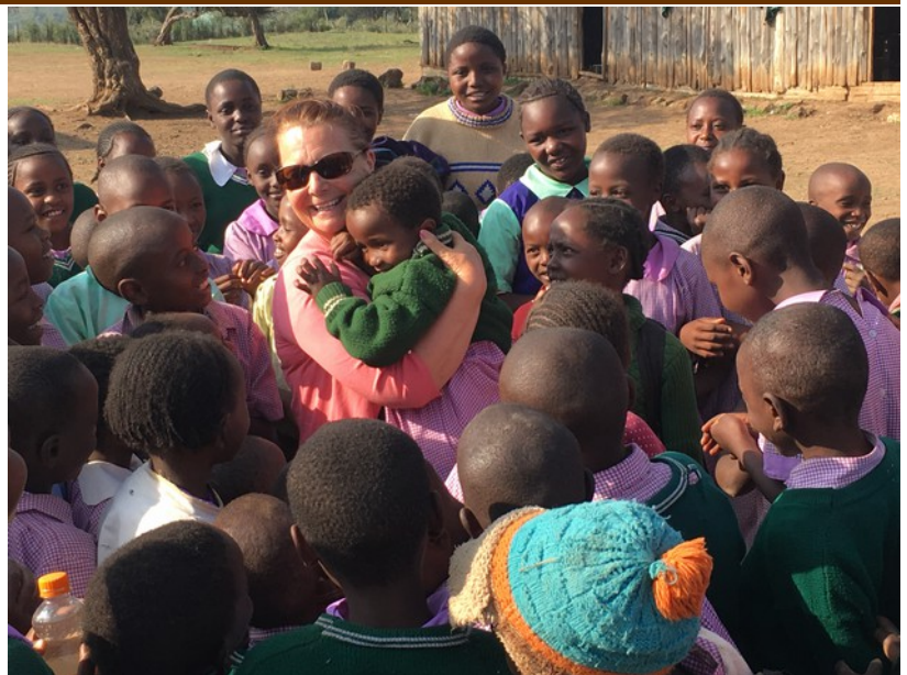
First white person at Muthangira Primary School in Kenya

distributed kits at several schools, and the Kenyan girls were thrilled they will no longer have to miss school when they have a period. After the California students left, I visited a number of schools in the area to assess needs as we look at possible future projects. I will write an article about some of those next month. At most of these very remote schools, I was the first white person that the children had ever seen and they all wanted to touch my skin and hair. Often, I was invited to the home of one of the families for a cup of tea, and so that all of the village parents could come and meet me. I drank an unbelievable amount of tea in the two weeks I was there!