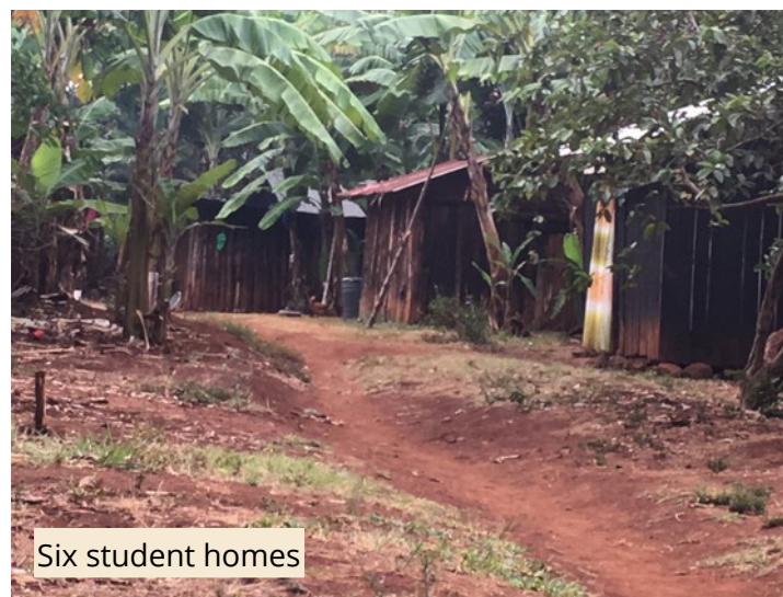
Six student homes

All of the travelers took two large duffel bags filled with donations, which were given to four schools in the area. We took lots of sports equipment, team uniforms, and school supplies. We also took a donated keyboard (which had been requested by the music teacher) and lots of fabric for the sewing center to make ODFL's Girls Equality Project (GEP) Kits.